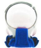
PAP Neck Pad