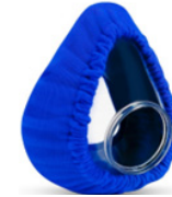
Reusable Mask Liners